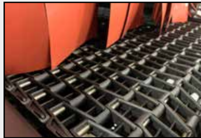
Optional Falcon Belt for LDPE Film