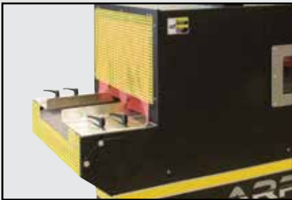
Optional Guarding Available