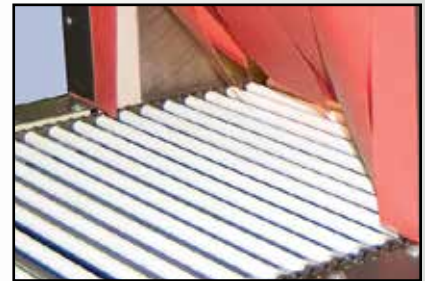
Optional Roller Belt

Complete Aftermarket Service & Support for Your Packaging Equipment