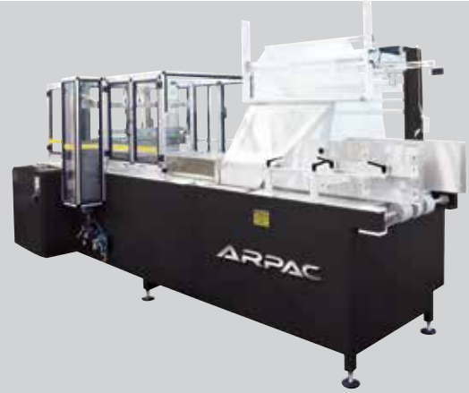
Intermittent Motion Shrink Wrappers