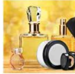
Health & Beauty