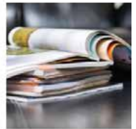
Printing & Publishing