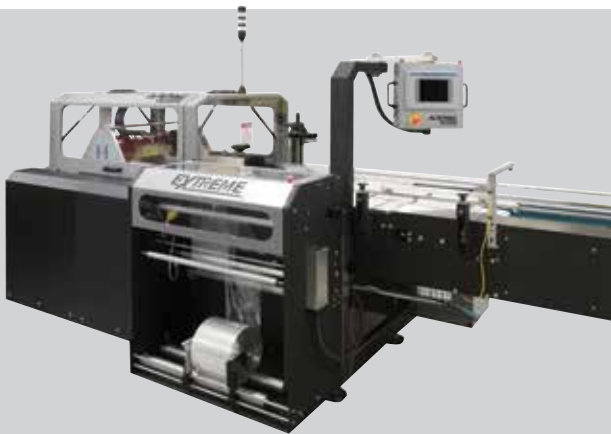
Continuous Motion Shrink Wrappers