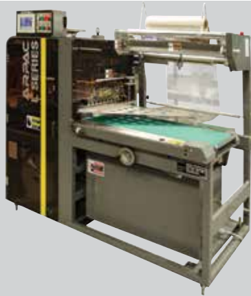
Automatic L-Bar Shrink Wrappers