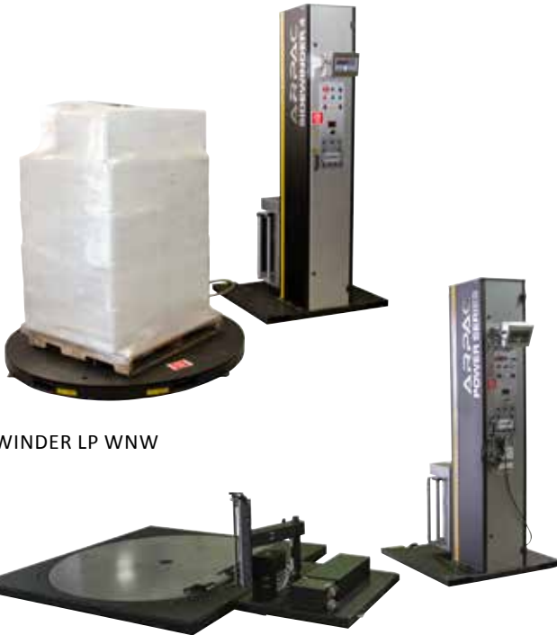
SIDEWINDER LP WNW