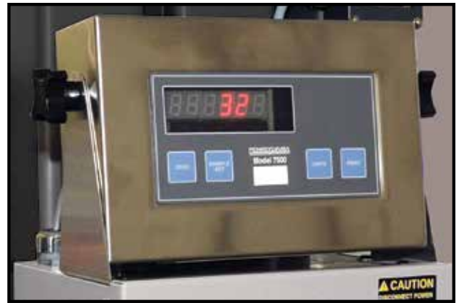
WRAP-N-WEIGH® Operator Controls