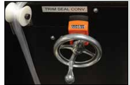
Dial Indicators On All Manual Adjustments

Complete Aftermarket Service & Support for Your Packaging Equipment