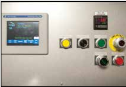
User-Friendly Operator Interface