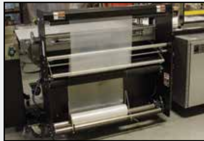
Side Mounted Film Cradle for Easy Film Loading