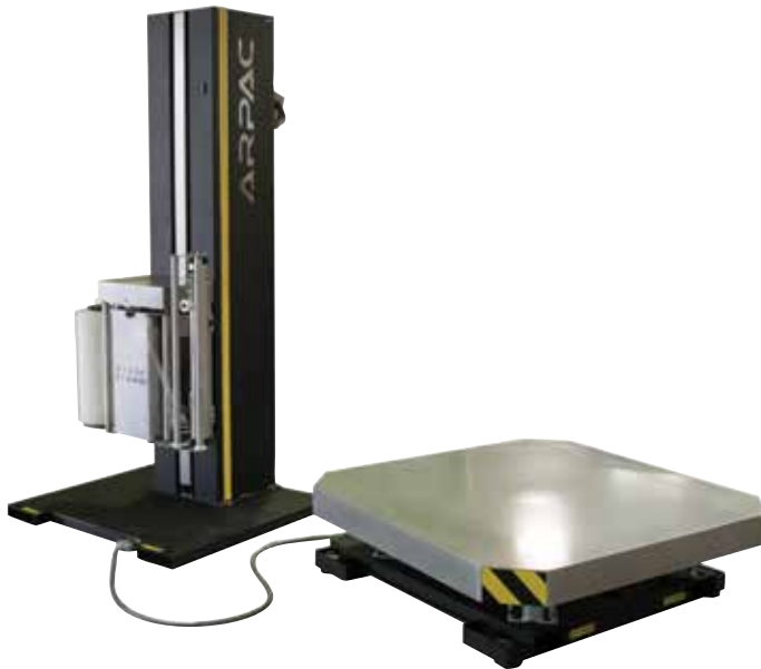
High-Profile Wrap-N-Weigh Shown