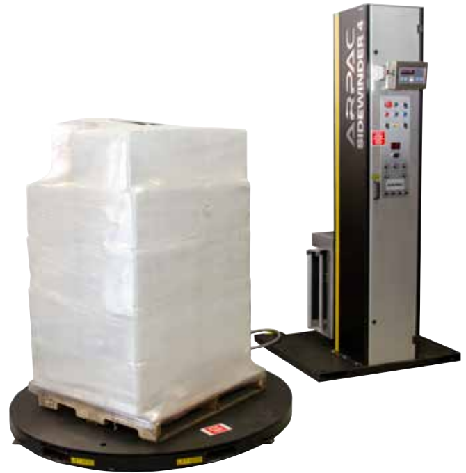
Low-Profile Wrap-N-Weigh Shown