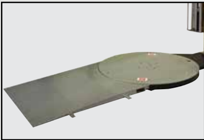
Optional Ramps Available