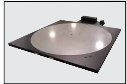
Optional 90" Table

Complete Aftermarket Service & Support for Your Packaging Equipment