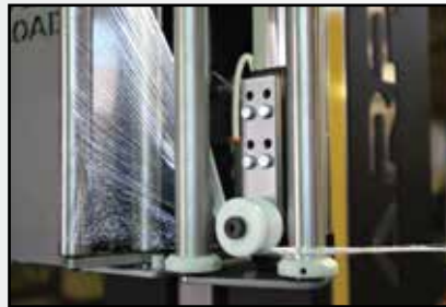
Optional Automatic Roping Device